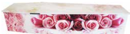
Reflections – Personalised Picture Coffins Choose from a ready-made design or design your own £920