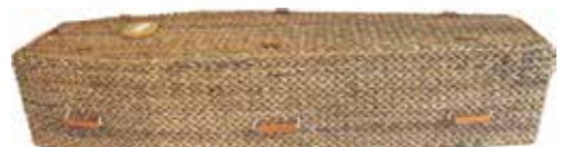
Banana Leaf – Coffin shape* (also available in Casket shape*) £995