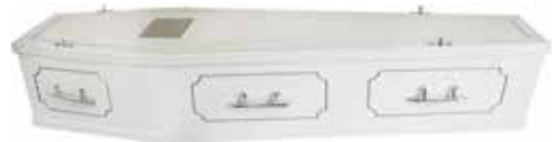
Oxford White – White Painted Veneer (also available in a range of colours - £720) £670