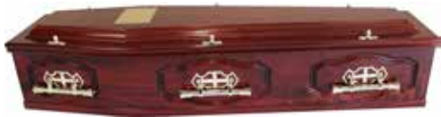
Windsor – Semi-Solid Mahogany (also available in Oak) £720