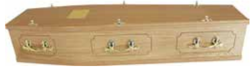
Rochester – Oak Veneer £520