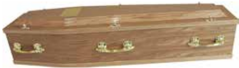
Worcester – Oak Veneer (also available in Mahogany) £595