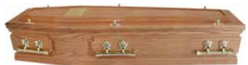
Westminster – Solid Oak (also available in Mahogany) £865