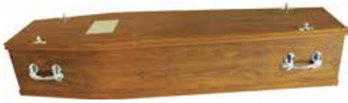
York – Oak Effect Foil Veneer £445