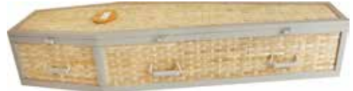
Premium Bamboo* £720