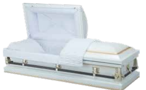
American-Style Caskets* American-style Caskets are available in wood or metal in a wide selection of designs From £1,470