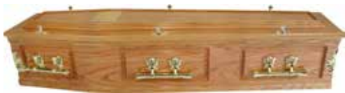
Surrey – Solid Oak (also available in Mahogany) £845